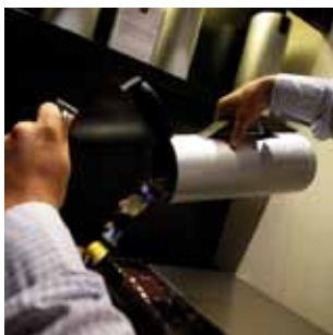
◀ Returning used capsules to a Nespresso boutique for recycling