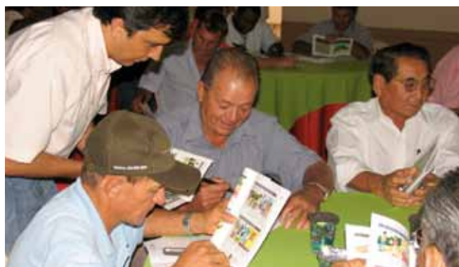
Farm assessment workshop with coffee farmers ▼